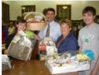
2008 adult summer reading program gift basket winners.