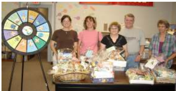
2007 Adult Summer Reading Program Basket Winners!