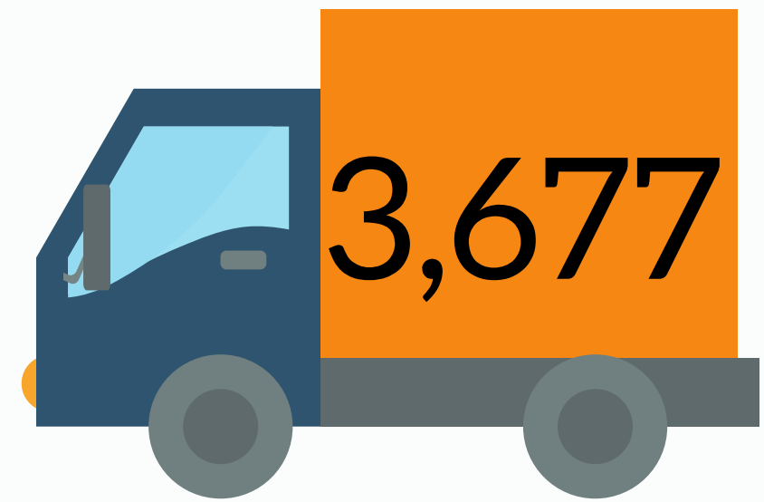
Items received from other Nioga Libraries